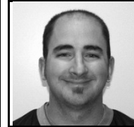
#9 Flood, R