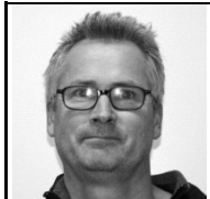
#00 Burns, M