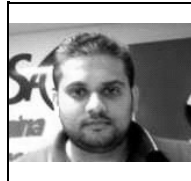
#2 Bhagaloo, N