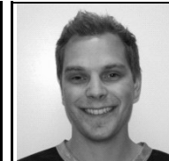
#3 Aarebrot, F