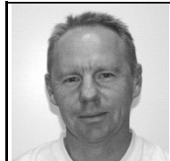
#2 Barton, D