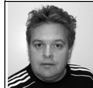
#1 Ambroz, D