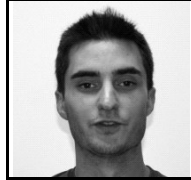
#15 Sauchyn, R